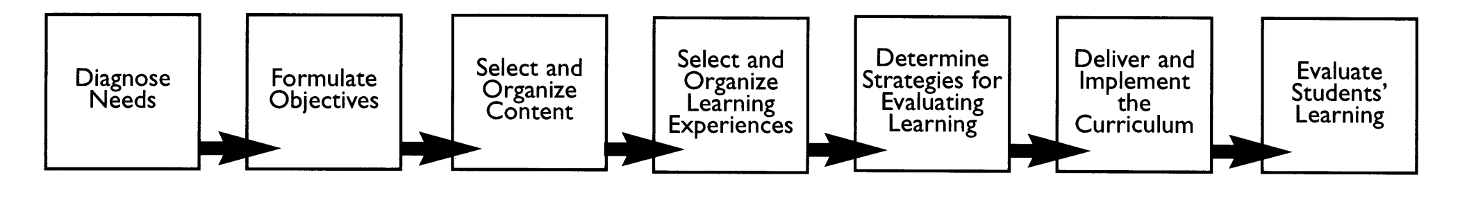
Figure 1. A Positivist Approach to Curriculum Planning